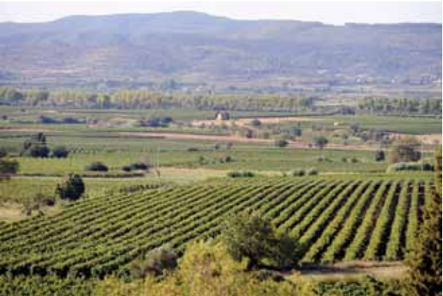
A selection of excellent wines from the Pays d'Oc and the Côtes de Thongue in the Languedoc region. The 'terroir' ranges over ancient terraces of rocky outcrops linking Beziers to Pezenas.